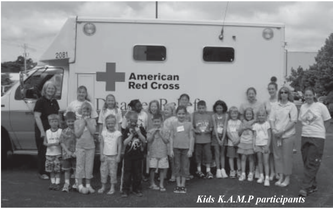
Kids K.A.M.P participants

Twice this year, the Red Cross office was home to a week-long Kids K.A.M.P. (Kids Are More Prepared) to teach children necessary safety skills. A total of